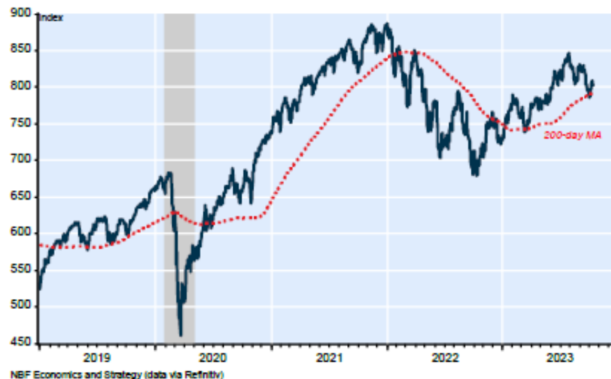
World: Equity markets under pressure MSCI ACWI